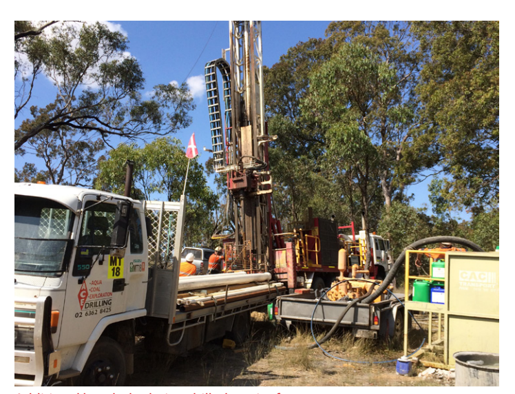
Additional boreholes being drilled on site for groundwater sampling and monitoring.

It is proposed to install three clustered PVC monitoring bores, two alluvial monitoring bores and four multi-level Vibrating Wireline Piezometer sites (VWP). Some of the VWP sites will involve boreholes in excess of 300 metres deep which will be close to the deepest holes drilled in the project area.