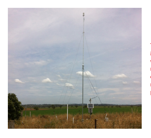
The West Muswellbrook weather station monitors local conditions for the northern part of the project area.