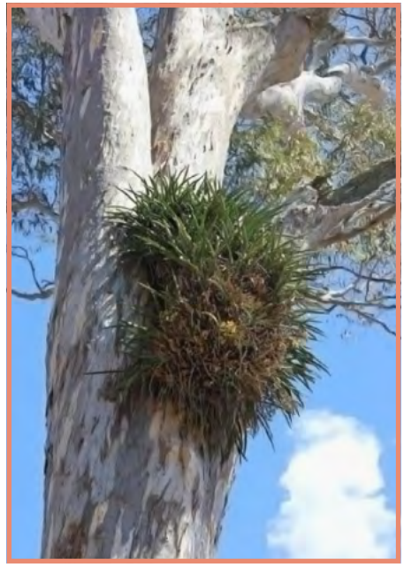
Cymbidium canaliculatum in Eucalyptus dawsonii host tree

Two of the threatened animal species recorded are also listed under the EPBC Act. These include the Australian Painted Snipe and Large-eared Pied Bat. A further six animal species listed under the EPBC Act have potential habitat in the assessment area. Two migratory animals were recorded during field surveys, the Rainbow Bee-eater and Blackfaced Monarch, and a further six migratory species have potential habitat in the area.