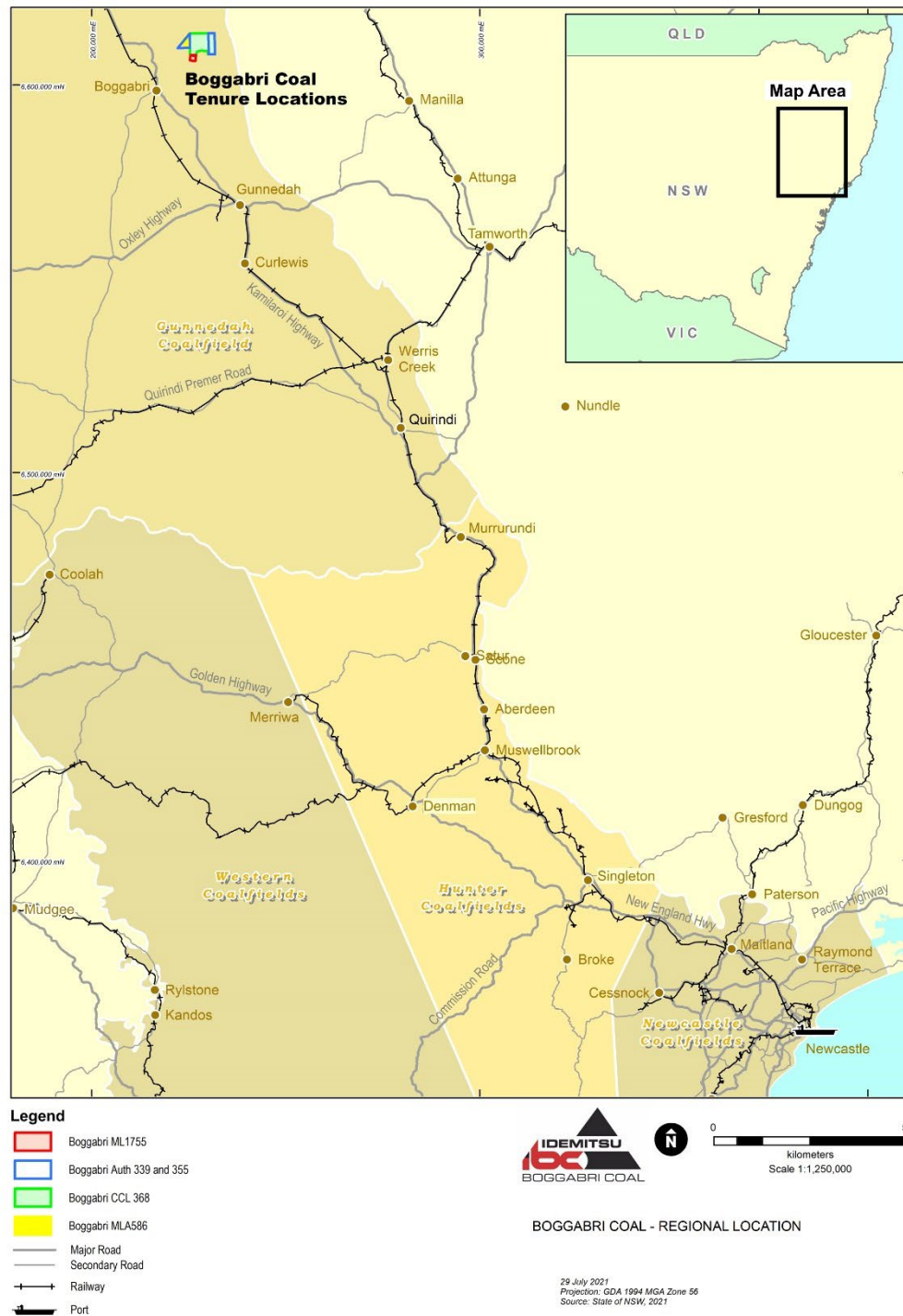
Figure 1-1: Boggabri Regional Location