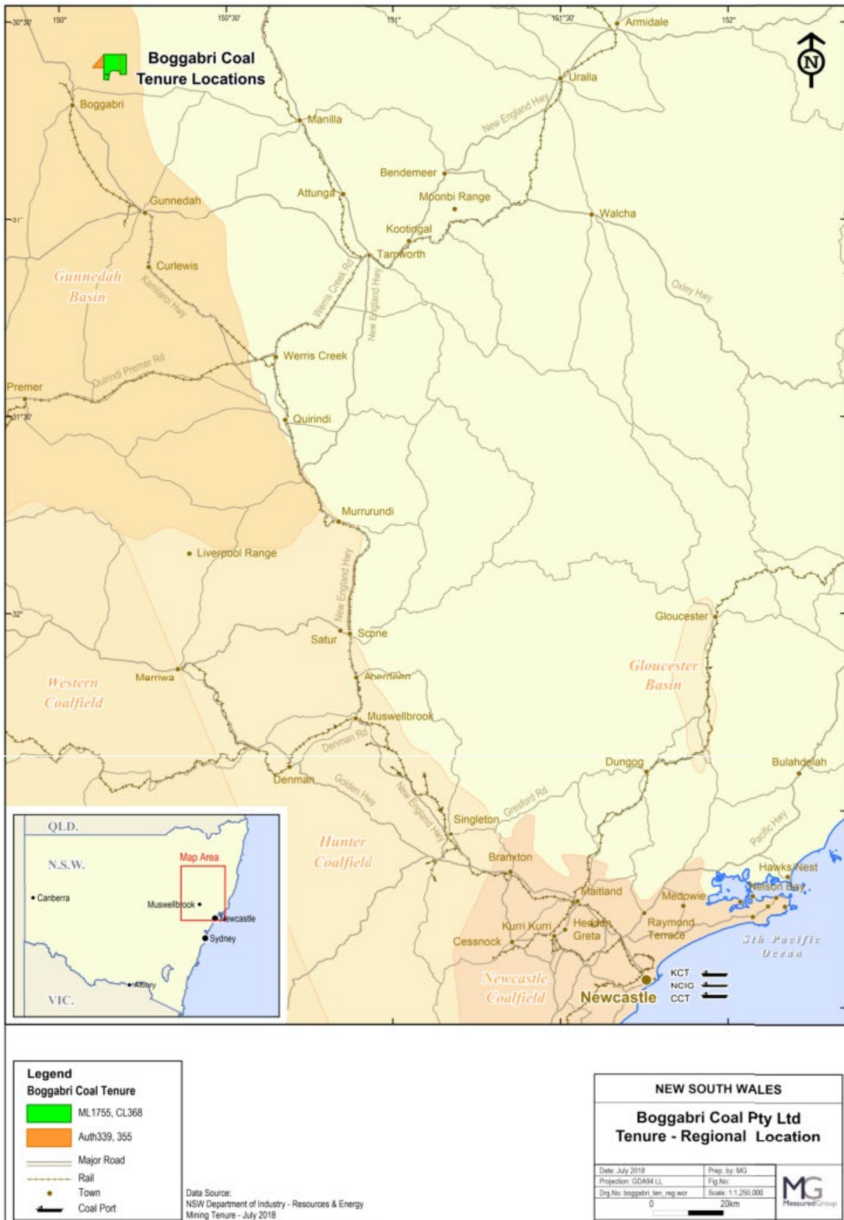
Figure 5.1: Location of Boggabri Coal Project A339