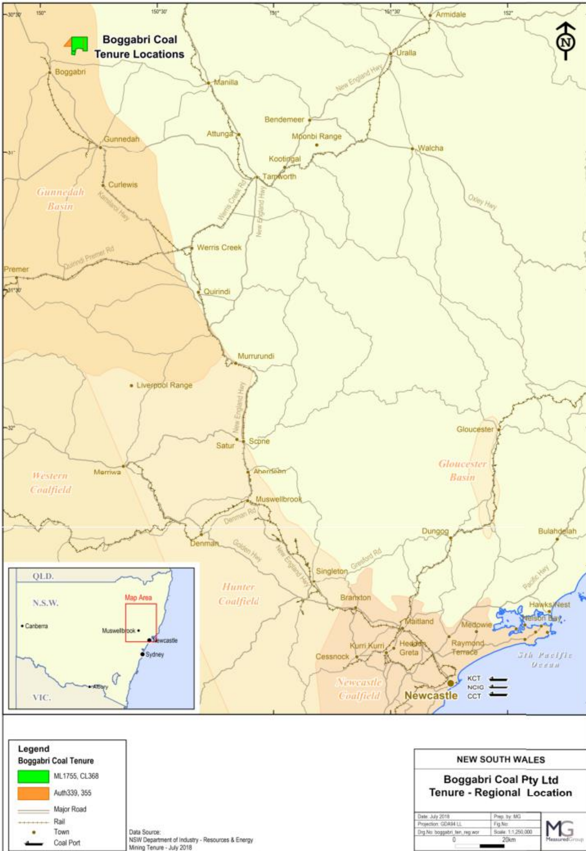
Figure 5.1: Location of Boggabri Coal Project A339